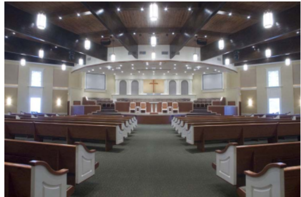
Figure 3 : Examples of sound, acoustics, video and theatrical lighting designs

Media Design Group provides designs for theater, courtrooms, educational training, public safety and conference facilities. We provide our clients with the best, comprehensive designs available. Our services include complete turn-key designs, construction administration and final commissioning. 50% of our work is churches, 25% higher education/commercial applications, 25% Government.