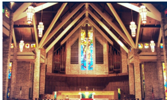
Figure 2 : Example of custom fly cross loudspeaker cluster

Our job is to work with you or your Architect to determine the budget of the project BEFORE seeking bids from a list of PRE-QUALIFIED AV Contractors, eliminate the gray areas where scopes may potentially cross between the AV Contractor, electrician and general