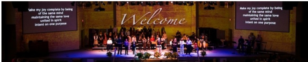
Figure 1: Example of "vertical set" using video projection

Design Consulting means that we as a Consultant Group do not have an agenda or loyalty to any manufacturing company. We do not sell equipment. Therefore, we design the systems that fits your applications and budgets without outside influence of any manufacturer or sales quota. We provide this service by creating a design consistent with industry standards and broadcast practices, drawings showing how (and where) the systems are to be installed, providing a specific list of equipment to be provided and installed, monitoring the installation process, and providing final testing and commissioning of the systems to assure the systems are performing in accordance to the specifications provided, followed by required training of your personnel by the AV Contractor before we approve final payment should be made.